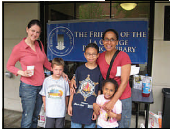
Two families enjoy The Friends of the Library's Summer Reading Kick Off with donuts and coffee on June 8.