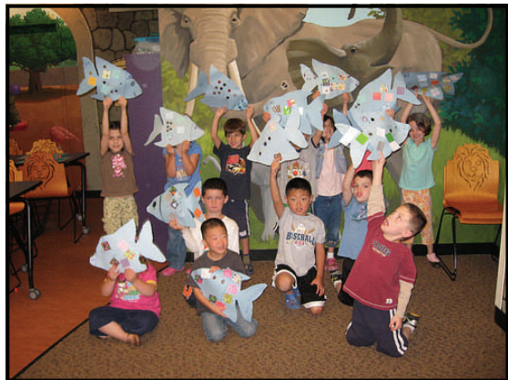
Kids show off The Rainbow Fish craft they made at the Storybook Art program on June 10.

SUMMER READING FUN! Did you know that you can view photos of programs at the Library on Flickr? Go to the Library's website lagrangelibrary.org and look for the Flickr box on the bottom left or try http://www.flickr.com/photos/lagrangelibrary/ .