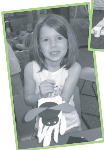
"Puppet workshop" on June 17.