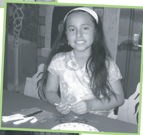
"Puppet workshop" on June 17.