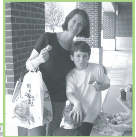
Donuts as big as your head at "Summer Reading Kick-off" on June 9.