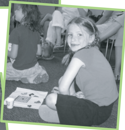
"M & M" Bingo on June 17.