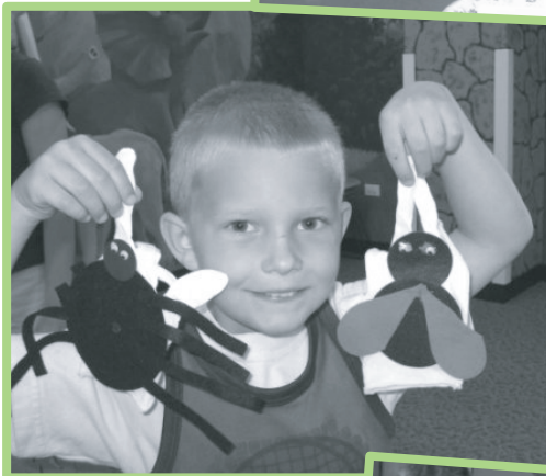
"Puppet workshop" on June 17.