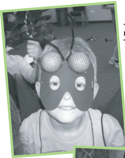
"Metamorphosis" program on June 12.

Give yourselves a pat on the back, a round of applause and an ice cream sundae at our third annual End-of-Summer-Reading-Program Party! Work up an appetite playing Cosmic Twister – the game you know and love, played with glow-in-the-dark mats! Undergo a facial metamorphosis – get your face painted --with phosphorescent paint, which will look SO cool under blacklights! Finally, help yourself to our do-it-yourself sundae bar – all to celebrate the end of six wonderful weeks of reading! And of course – registration is required.